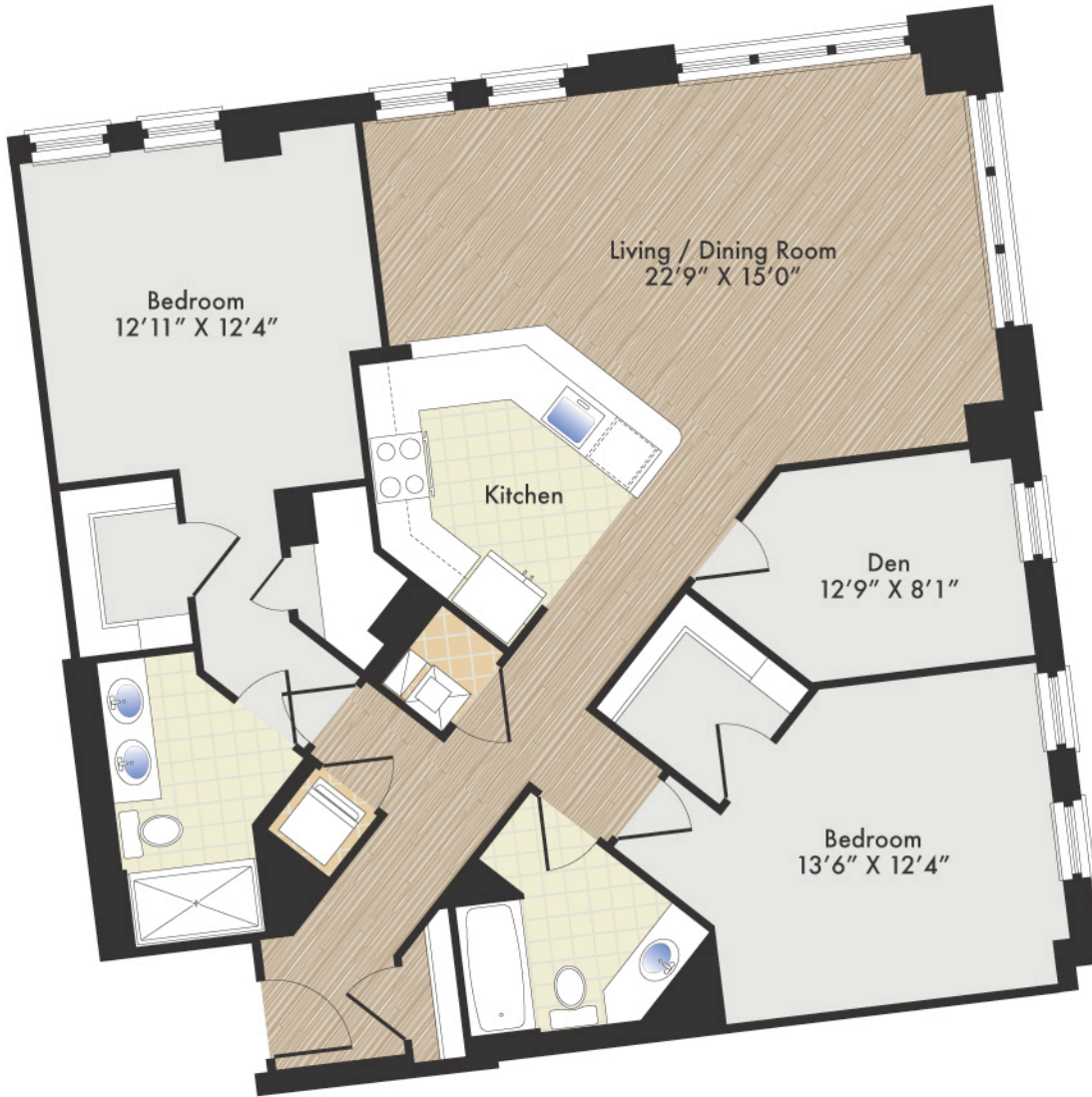
Typical 3rd and 4th levels